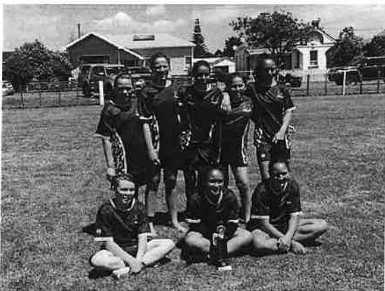
Our winning Senior Girls' Sevens team.

Our boys 7's team played an experienced Opotiki Primary team for the Don Clark boots, losing 42-0. Although we lost, the pleasing aspect was the positive attitude of our boys.